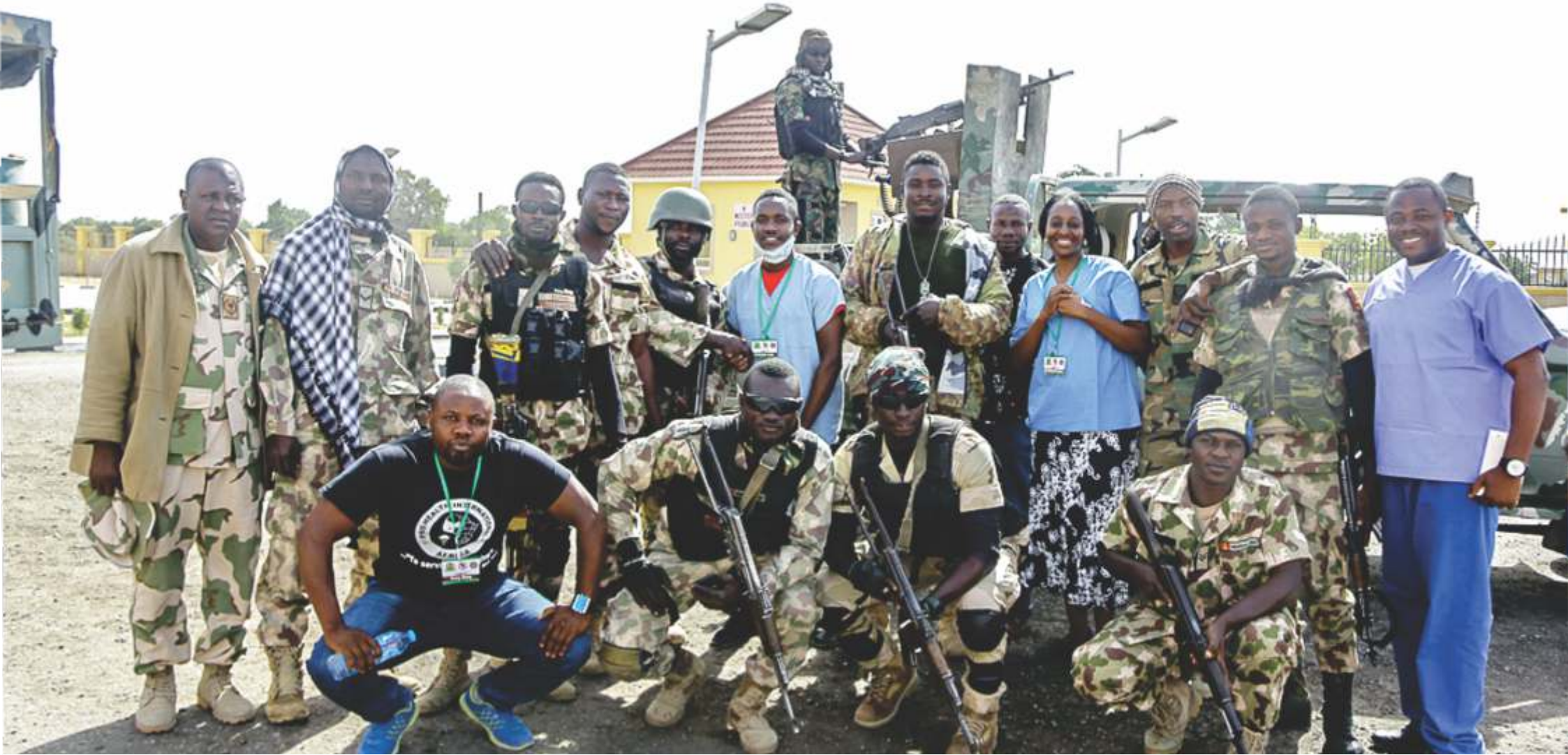
© The Educator | Pro-Health Medical Mission to Maiduguri North East Region of Nigeria | 2018